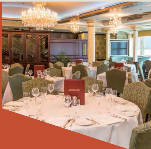
(Pictured right: The Astoria Dining Room)

Night after night, music fills The Show Lounge, elegantly decorated with crystal chandeliers, authentic period-wallpaper, and comfortable seating reminiscent of a lumber baron's estate home. The River Grill & Bar and the Paddlewheel Lounge are meeting points for friends; and The Astoria Dining Room, reflecting the Northwest's rich Russian influence, is graced with romantic columns, sparkling light fixtures, and exquisite upholstery—the perfect backdrop to sample regional dishes.