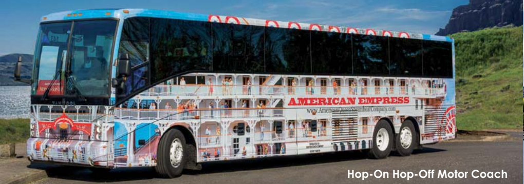
Hop-On Hop-Off Motor Coach