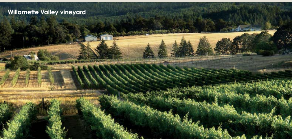
Willamette Valley vineyard

Global Destinations Management, Ltd. and Go Next, Inc. are not responsible for injuries or losses resulting from any causes beyond their own respective and exclusive control. Global Destinations Management, Ltd. and Go Next, Inc. are not responsible for the negligence of the other or any other suppliers or providers. Land accommodations, local transportation, and sightseeing are arranged and operated by Hometown Advantage in Portland and Grape Escape in Willamette Valley, which may use other suppliers or providers to render the services. HOTEL AND SIGHTSEEING ARE SUBJECT TO CHANGE.