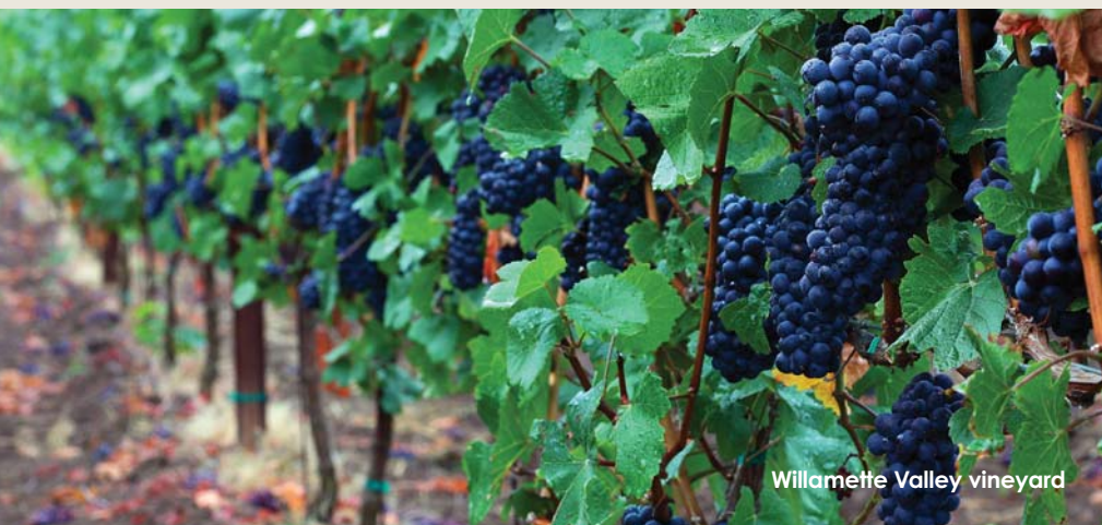
Willamette Valley vineyard

HOTEL AND SIGHTSEEING ARE SUBJECT TO CHANGE.