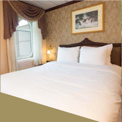
(Pictured right: C Stateroom)

The American Empress is a breathtaking combination of modern comfort and Victorian charm. All suites and staterooms feature a flat-screen TV, extravagant bedding and fine linens, a mini refrigerator, and luxury hotel-style service. Take in resplendent scenery as you enjoy a quiet respite in your stylish suite or deluxe stateroom, designed with all the comforts of home. Life aboard the American Empress flows at your pace, according to your taste.